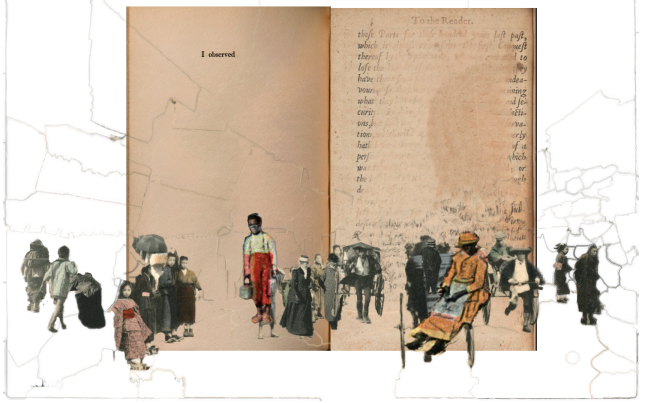
Echoes of Experience by Valentina Rodríguez Morales. Image by the artist.

image as a historical object, either as a document of a specific moment or as a node that are repeated in time and allow fictionalizing between different realities and possibilities temporalities, opening new unconventional narratives and establishing a dialogue between the present and the past. She describes her work Echoes of Experience in the ONB-Labs Art Program as follows: "This project presents a digital open letter using the Travelogues and AKON archive from the library's digital collection. This work arises primarily from a sentimental relationship with the archive and personal experiences as a migrant. The starting point was the reconfiguration of the collected text for the creation of a new metafictional archive that relates the feeling of foreignness and exoticism linked to the arrival in a new territory, and of course the stereotypes that this entails. The visitor can go through the narration without any specific order and submit oneself to the exercise of empathy and of finding oneself in what is foreign."