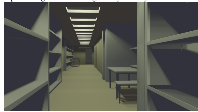
Blumenstadt Venedig oder die Elektrische Stadt. Exterritorial by Katharina Birkmann. Image by the artist.

fictional architectures, introduces concepts and stories of locality, fiction, simulation and virtuality. The potential to make archives spatially experienceable as scripts for storytelling - documentary or fictional - enables experiencing and actualizing history as story."