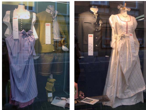
Figure 1. Klagenfurt's zentrum (city center) shop windows of dirndls and lederhosen. When are these worn? Who wears them? Consider race, ethnicity, age, gender, sexuality, social units, and social class. What activities does one do in wearing an apron, or in wearing leather shorts?

The images we spent time talking about were dirndls and lederhosen featured in store shop windows, which are traditional clothes for weddings and other special events in Austria. Most of the women in this class owned several dirndls. These have aprons. I asked about associations with aprons. Where are they worn, who wears aprons, to do what activities? Students had not previously thought about dirndls in this way. They discussed the cooking and cleaning activities, in caring for others, that aprons as visual culture suggests. The other set of images we talked about were two posters in storefront windows on either side of the main entrance to a shoe store. Both images were intended to entice men and women to buy shoes, but the strategies differed.