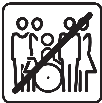
Enge Kontakte meiden Avoid close contacts