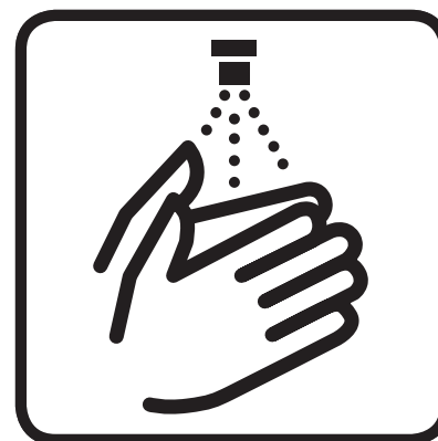
Hände desinfizieren Desinfect hands

Weitere Informationen: Further information: