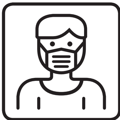
FFP2-Maske tragen Wear FFP2 mask